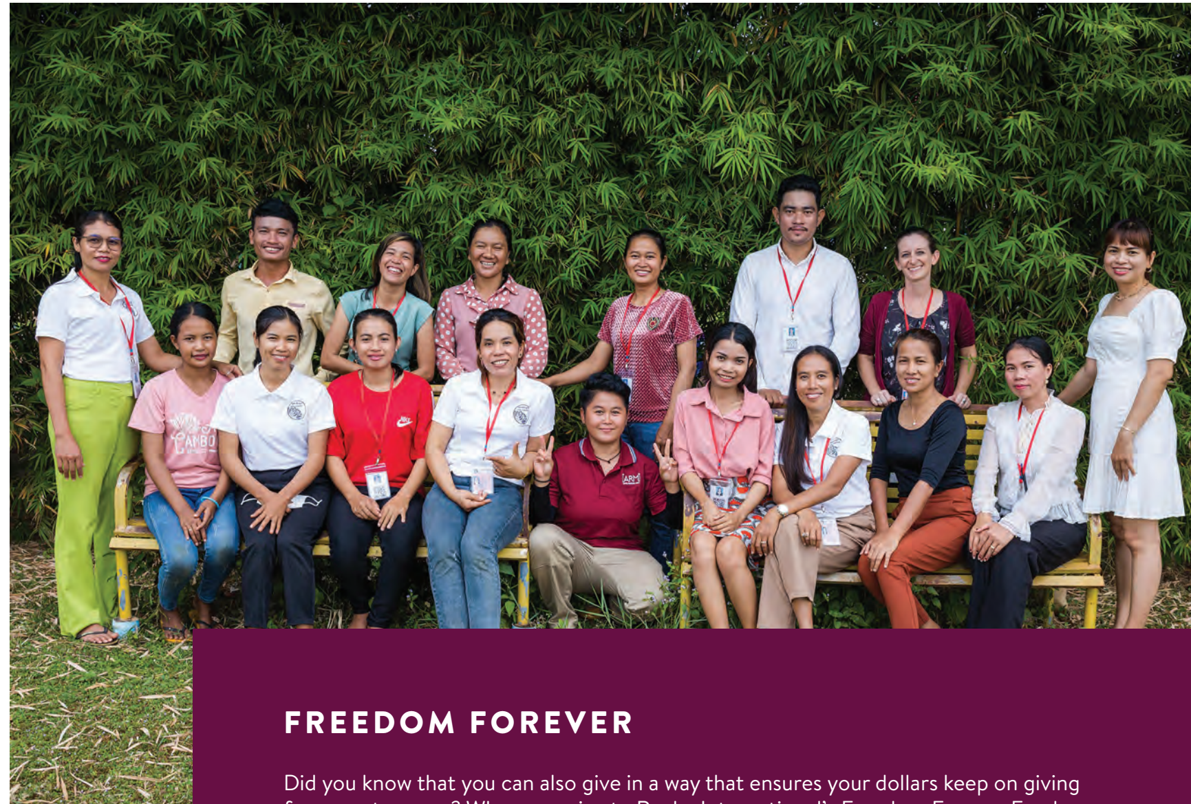
Team Members in Siem Reap, Cambodia.