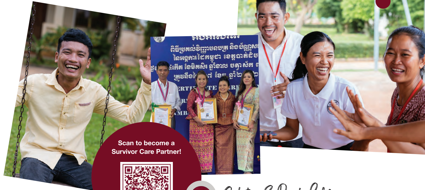
Staff celebrating Rapha’s team in Cambodia.

Rapha provides intensive, specialized services to child survivors of human trafficking, exploitation, and abuse.